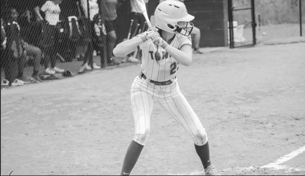
Following a hiatus, Towns opened Region 8-A at home vs. Washington-Wilkes.

"We have to be ready to play each and every time we step onto the dirt," commented Livingston who was proud of